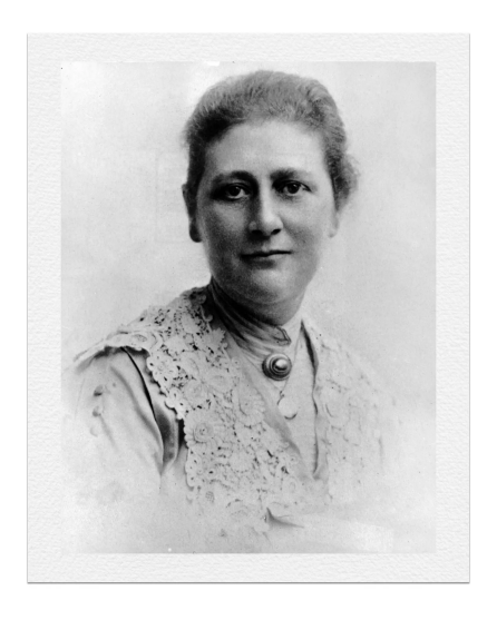
Potter in the 1890s. She wrote 23 books, whimsical, razor-sharp stories about characters, like Jemima Puddle-Duck and Benjamin Bunny, that would endure.

The world that Potter conjured in her books — whimsical but dark, full of bloodless observations about the food chain — appealed as much to adults as to children.