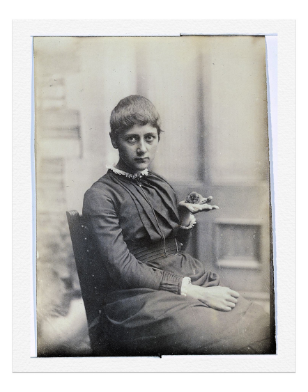
Potter with her pet mouse Xarifa in 1885. She made regular trips to the Natural History Museum in London to find specimens to draw.

It also gave Potter a pathway out of the overbearing home life that confined most women in her day.