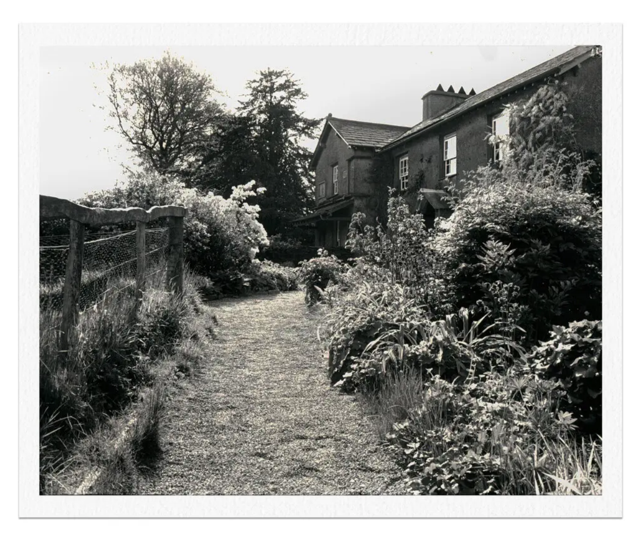
In 1905, Potter bought Hilltop Farm, in England's \ Lake \ District, where she became a prize winning sheep breeder and a conservation ist. \ The \ New York \ Times \ Potter \ Potter \ Potter \ Potter \ Potter \ Potter \ Potter \ Potter \ Potter \ Potter \ Potter \ Potter \ Potter \ Potter \ Potter \ Potter \ Potter \ Potter \ Potter \ Potter \ Potter \ Potter \ Potter \ Potter \ Potter \ Potter \ Potter \ Potter \ Potter \ Potter \ Potter \ Potter \ Potter \ Potter \ Potter \ Potter \ Potter \ Potter \ Potter \ Potter \ Potter \ Potter \ Potter \ Potter \ Potter \ Potter \ Potter \ Potter \ Potter \ Potter \ Potter \ Potter \ Potter \ Potter \ Potter \ Potter \ Potter \ Potter \ Potter \ Potter \ Potter \ Potter \ Potter \ Potter \ Potter \ Potter \ Potter \ Potter \ Potter \ Potter \ Potter \ Potter \ Potter \ Potter \ Potter \ Potter \ Potter \ Potter \ Potter \ Potter \ Potter \ Potter \ Potter \ Potter \ Potter \ Potter \ Potter \ Potter \ Potter \ Potter \ Potter \ Potter \ Potter \ Potter \ Potter \ Potter \ Potter \ Potter \ Potter \ Potter \ Potter \ Potter \ Potter \ Potter \ Potter \ Potter \ Potter \ Potter \ Potter \ Potter \ Potter \ Potter \ Potter \ Potter \ Potter \ Potter \ Potter \ Potter \ Potter \ Potter \ Potter \ Potter \ Potter \ Potter \ Potter \ Potter \ Potter \ Potter \ Potter \ Potter \ Potter \ Potter \ Potter \ Potter \ Potter \ Potter \ Potter \ Potter \ Potter \ Potter \ Potter \ Potter \ Potter \ Potter \ Potter \ Potter \ Potter \ Potter \ Potter \ Potter \ Potter \ Potter \ Potter \ Potter \ Potter \ Potter \ Potter \ Potter \ Potter \ Potter \ Potter \ Potter \ Potter \ Potter \ Potter \ Potter \ Potter \ Potter \ Potter \ Potter \ Potter \ Potter \ Potter \ Potter \ Potter \ Potter \ Potter \ Potter \ Potter \ Potter \ Potter \ Potter \ Potter \ Potter \ Potter \ Potter \ Potter \ Potter \ Potter \ Potter \ Potter \ Potter \ Potter \ Potter \ Potter \ Potter \ Potter \ Potter \ Potter \ Potter \ Potter \ Potter \ Potter \ Potter \ Potter \ Potter \ Potter \ Potter \ Potte

"Somehow when one is up to the eyes in work with real live animals, it makes one despise paper-book animals — but I mustn't say that to my publisher," she wrote cheekily to one of them in 1918.